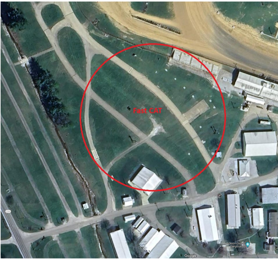
Site location Photo is not to scale.